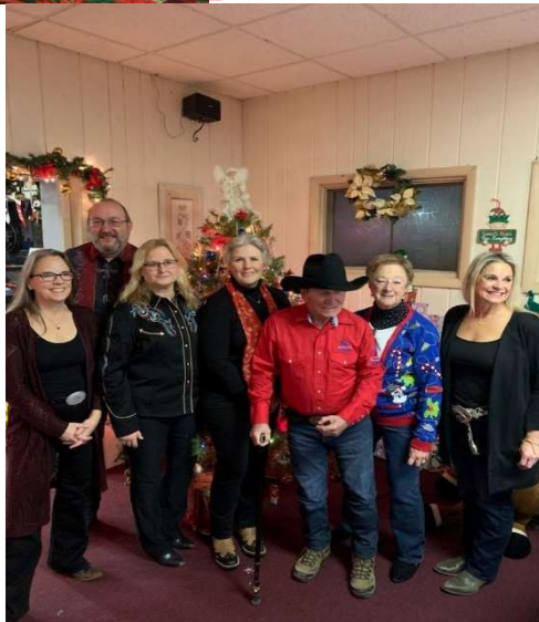
Past Presidents!!! Great turn out.